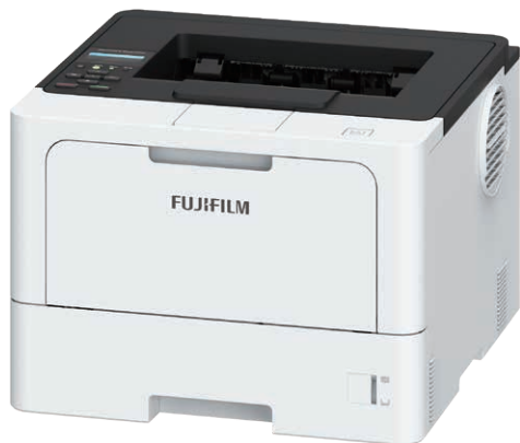
ApeosPrint 4620 SDW